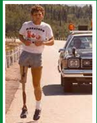
HAK's Terry Fox Run date is TBD!

Sept 30- National Day for Truth and Reconciliation, No School